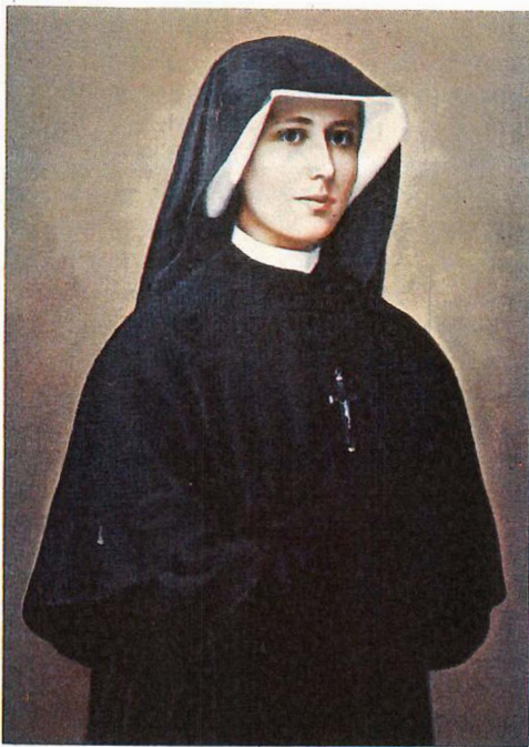
The Apostle of Divine Mercy The Venerable Servant of God — SISTER M. FAUSTINA KOWALSKA — of the Congregation of the Sisters of Our Lady of Mercy (1905 – 1938) U.S.A. 1-800-462-7426 Canada 1-800-344-2836

Marians of the Immaculate Conception MARIAN HELPERS STOCKBRIDGE, MA 01263